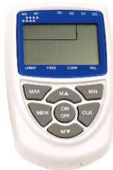
Handheld HI 1

Handheld HI 1 to read out the measurement: