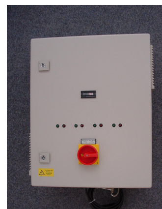
Tauchrohrsystem TRS 36